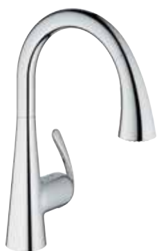
● ● 30 313 000 / 30 313 DC0 Electronic Sink Mixer with pull-down dual spray