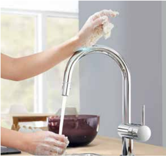
Simple activation/deactivation of the water flow by touch.