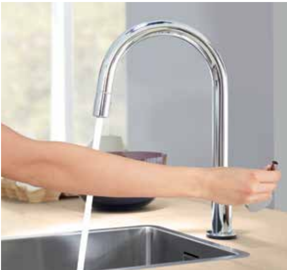
Manual control with the lever.

Ideal for busy kitchens where there's always something going on, GROHE EasyTouch is hygienic and convenient, and comes without any compromise on style. With GROHE'S innovative EasyTouch technology you can spend less time cleaning and more time cooking, baking, kneading, finger-painting...living.