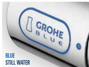
BLUE STILL WATER

The carbonator adds especially fine bubbles of carbonic acid to the filtered and chilled water to produce lightly sparkling or sparkling water according to taste.