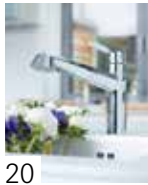
GROHE EURODISC® COSMOPOLITAN