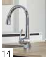
GROHE LADYLUX® CAFÉ