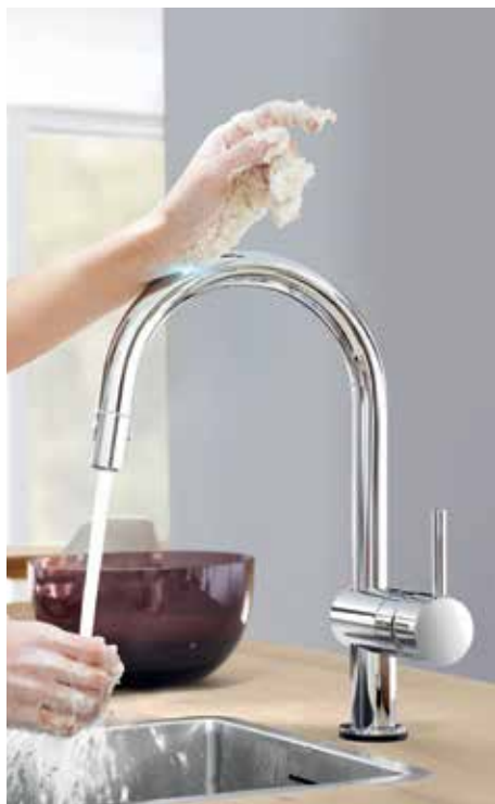
31 359 000 | 31 359 DCO Pull-down

Minta™ Touch has been approved and recommended for use by the elderly and those with physical disabilities. It has been tested and rated "good" by the Institute for Gerontotechnik for Barrier Free Building, due to its one-touch operating technology and ergonomic design.