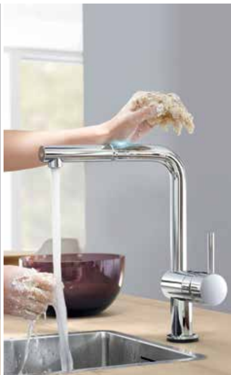
31 218 000 | 31 218 DCO Pull out