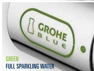
GREEN FULL SPARKLING WATER