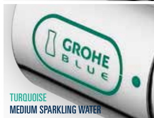
TURQUOISE MEDIUM SPARKLING WATER