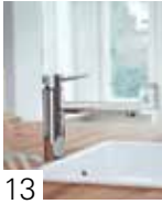
GROHE CONCETTO PULL-OUT