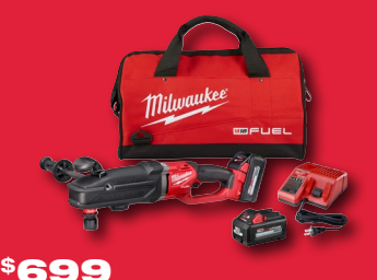
M18 FUEL™ SUPER HAWG W/ QUIK-LOK™ Kit (2811-22)