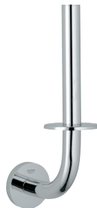
40 385 001 Spare toilet paper holder