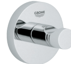
● ● 40 364 001 / EN1 Robe hook