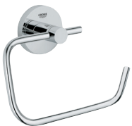
● ● 40 689 001 / EN1 Toilet paper holder without cover