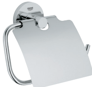
● ● 40 367 001 / EN1 Toilet paper holder