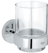
● ● 40 447 001 / EN1 Glass with holder