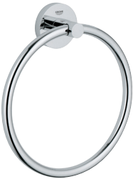
● ● 40 365 001 / EN1 8" Towel ring