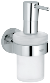
● ● 40 448 001 / EN1 Soap dispenser with holder