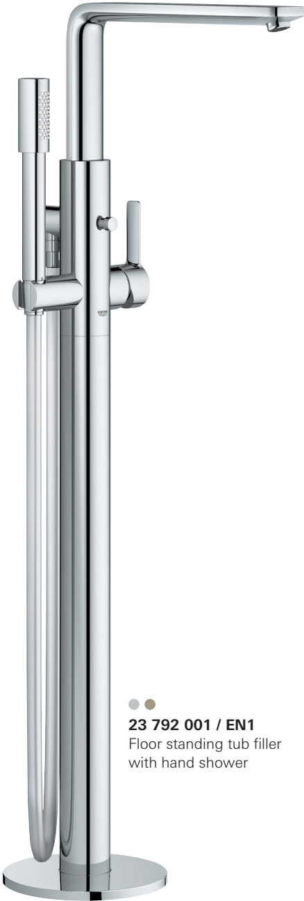
● ● 23 792 001 / EN1 Floor standing tub filler with hand shower